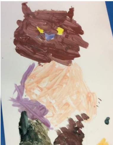
Paintings inspired from sharing "Where the wild things are".