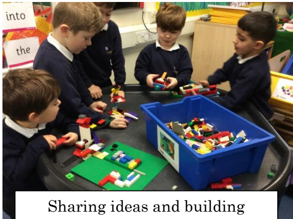
Sharing ideas and building models with the Lego. Talking and listening to one another.