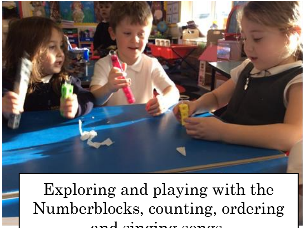
Exploring and playing with the Numberblocks, counting, ordering and singing songs.

Here are a few photos from Reception class this week. Ducklings have been busy concentrating, exploring and applying their learning within different activities.